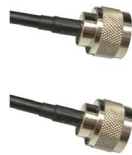
10 ft. Wireless, 400, N M-N M