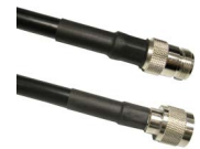
30 ft. Wireless, 400, N M-N F