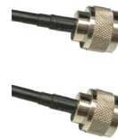
25 ft. Wireless, 400, N M-N M