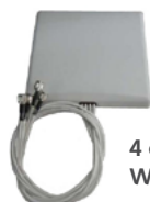
4 dBi Quad Patch Wi-Fi Antenna