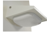
Right Angle Wall Bracket with Cover Access point mounts horizontally on wall for optimum performance. Cover provides maximum protection without RF interference.