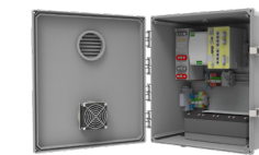
Integrated Power Systems Ensure your network is reliable, even in remote locations. Choose fully integrated systems with the radio to save time and reduce deployment errors.