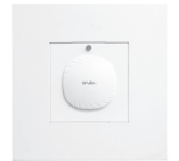
Ceiling Tile Enclosure Lightweight, powder-coated aluminum enclosure conceals and protects access points in suspended ceilings. Meets NEC300-22 and 300-23 for installation in plenum/air-handling areas.