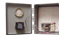
PoE Powered NEMA Enclosures Take indoor Wi-Fi outdoors, even in harsh environments with PoE-powered enclosures. Available heated and/or cooled.