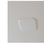
Flush Mount Ceiling Enclosure Conceals access point in a hard cap ceiling.