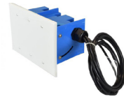
Junction Box Wi-Fi Antenna Wi-Fi antenna with articulation inside an electrical junction box for concealed connectivity. Mounts in walls or hard cap ceilings.