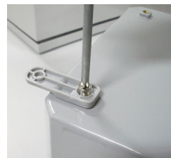
Vertical Feet Figure 3