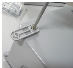
Horizontal Feet Figure 2