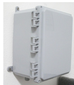
Mounted Solution Figure 6