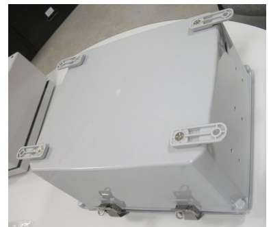
Finished Enclosure Figure 4