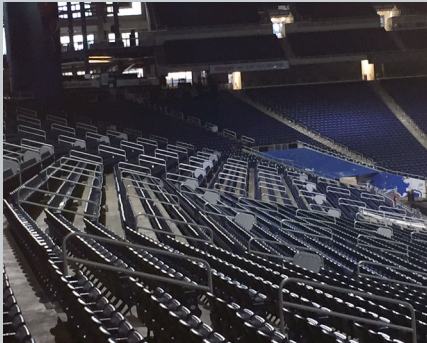
Multiple Handrail Enclosures installed in the lower bowl of the stadium